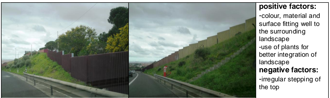
Figure 9 – Example of a barrier along the A2