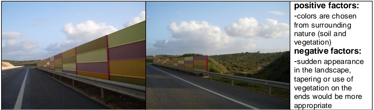
Figure 7 – Example of a barrier along the A22-IC4