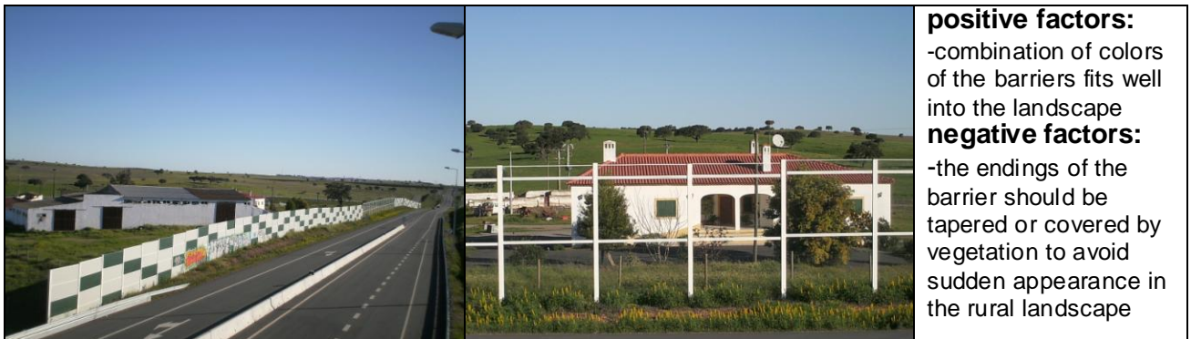
Figure 2 – Example of a barrier along the IC1