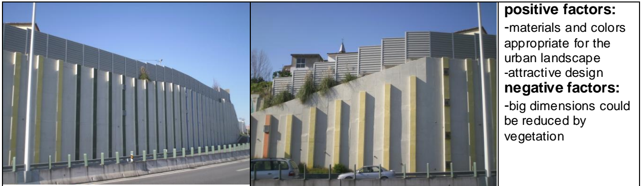
Figure 4 – Example of a barrier along the A43-IC29