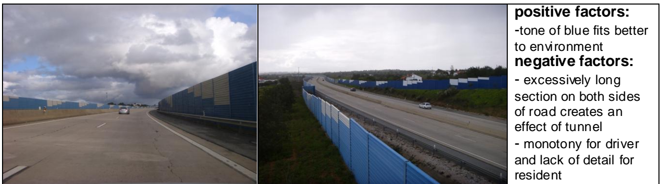
Figure 3 – Example of a barrier along the A22-IC4