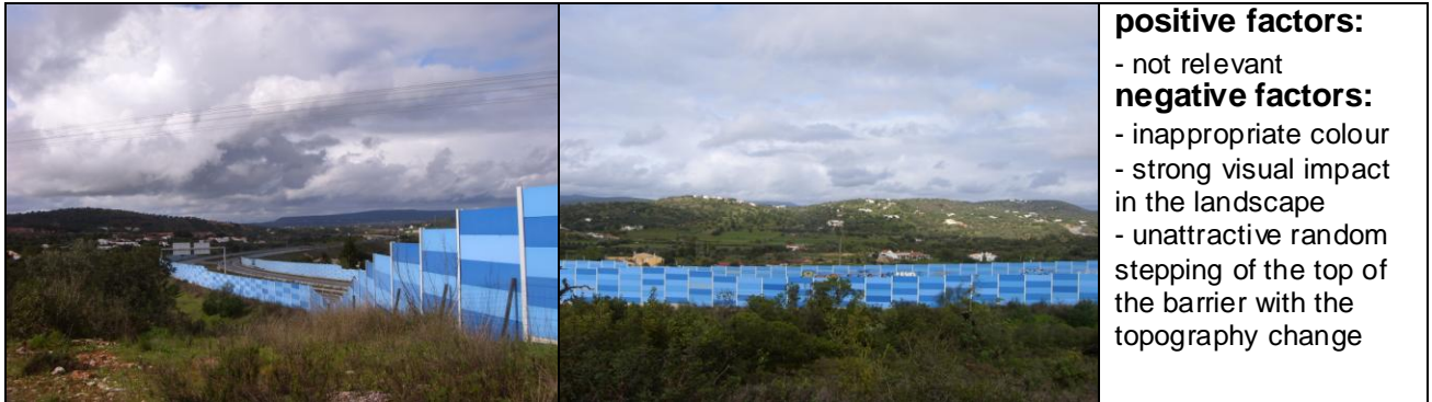
Figure 1 – Example of a barrier along the A2