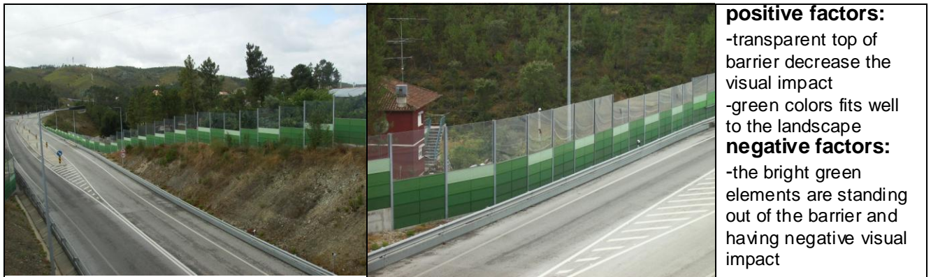
Figure 8 – Example of a barrier on the IC8