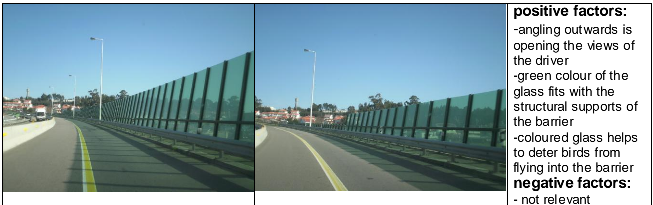
Figure 5 – Example of a barrier along the A43-IC29