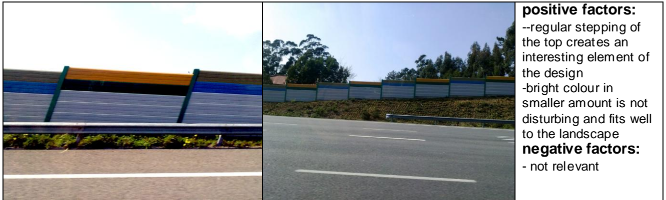
Figure 10 – Example of a barrier along the A1